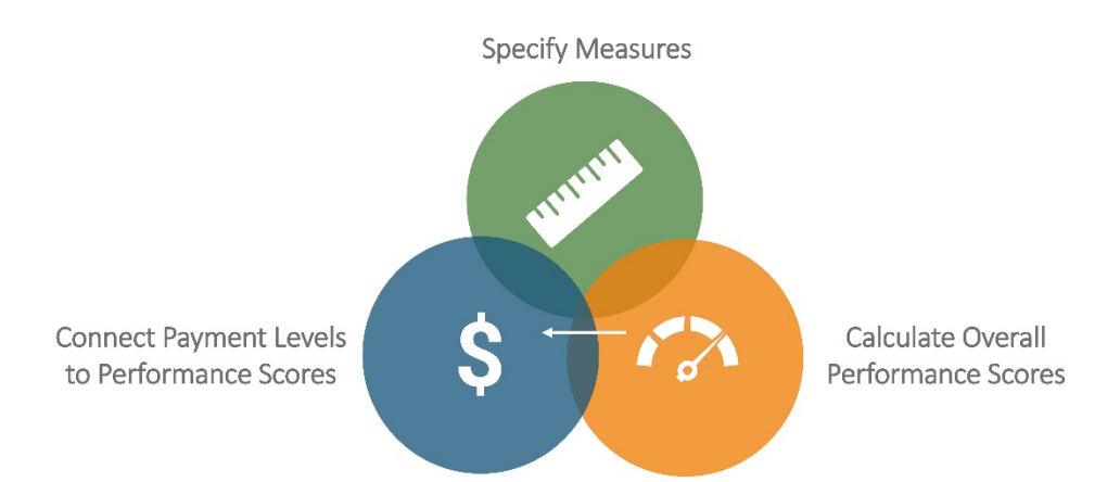
Figure 2: Components of Measurement Systems

By approaching the topic from the perspective of measurement systems and illuminating the idea that measures required for PBP models differ from those that have been useful under fee-for-service payment, the PBP Work Group hopes to chart new and fertile ground and drive alignments around broad-scale design elements in public and private sector PBP models—as confirmed by PBP-specific measurement systems.